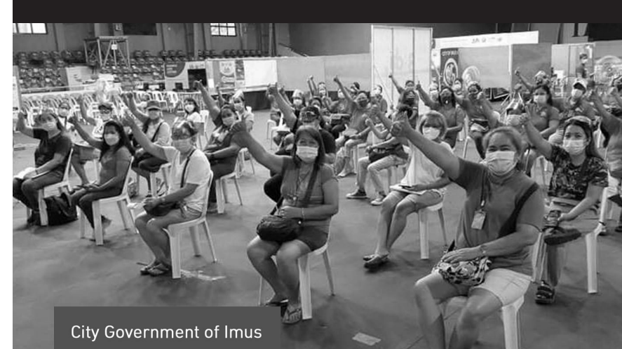
City Government of Imus